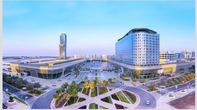
Abu Dhabi National Exhibition Centre