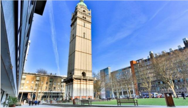
Celesta Venues London